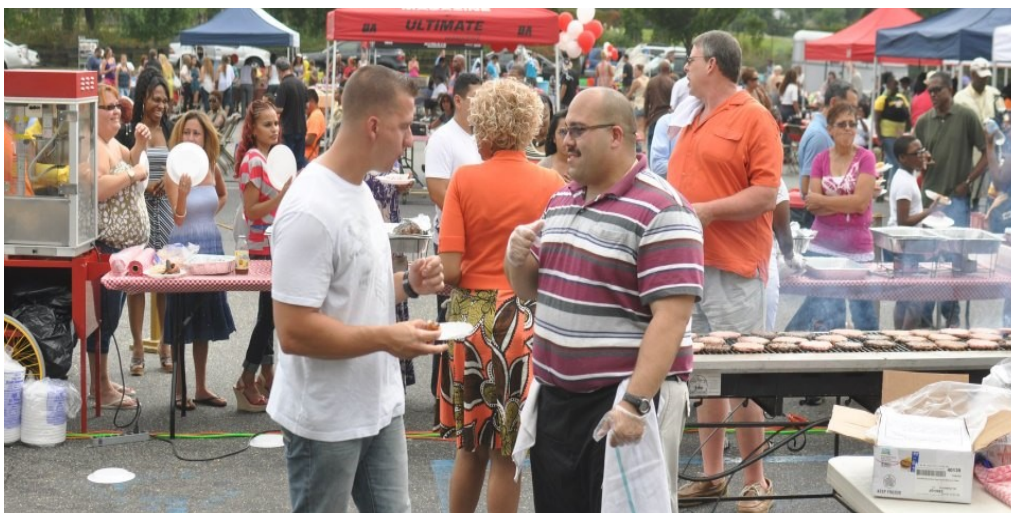
Labor Day BBQ weekend. A fun filled day of food, games and fellowship.