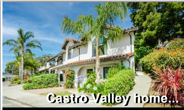
Castro Valley home...