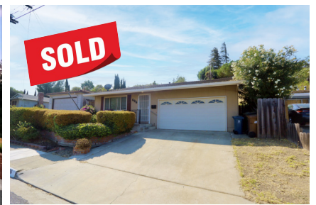
SHADDICK DR, ANTIOCH