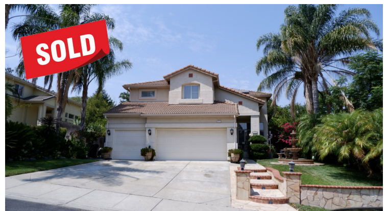
MARITA DR, ANTIOCH