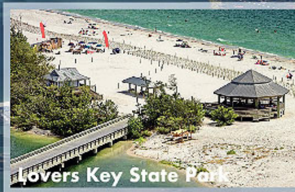
Lovers Key State Park