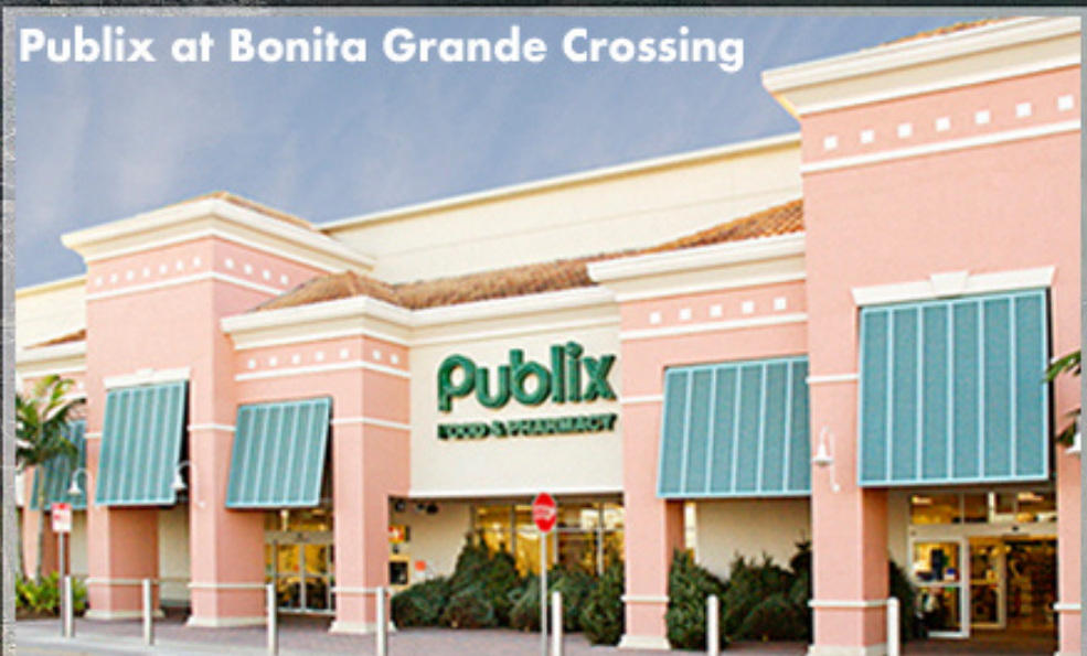
Publix at Bonita Grande Crossing