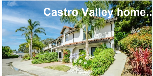
Castro Valley home..

Ranch Style Home On Almost a 5 Acres Lot Reap the benefits of building your multi-generation compound. Call 925-392-3202 for More Information.