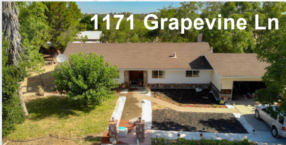
1171 Grapevine Ln

Ranch Style Home On Almost a 5 Acres Lot Reap the benefits of building your multi-generation compound. Call 925-392-3202 for More Information.