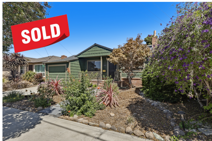
CLINTON AVE, RICHMOND