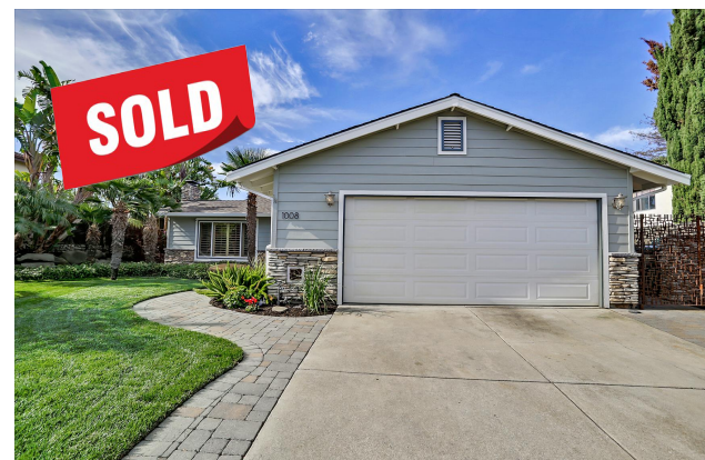
CALIFORNIA ST, RODEO