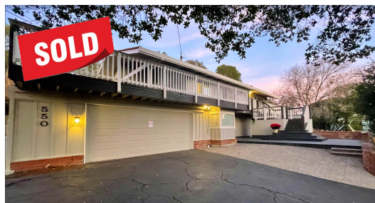
GOLF CLUB RD, PLEASANT HILL