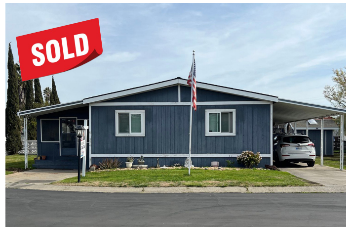
ALCOTT CT, BETHEL ISLAND