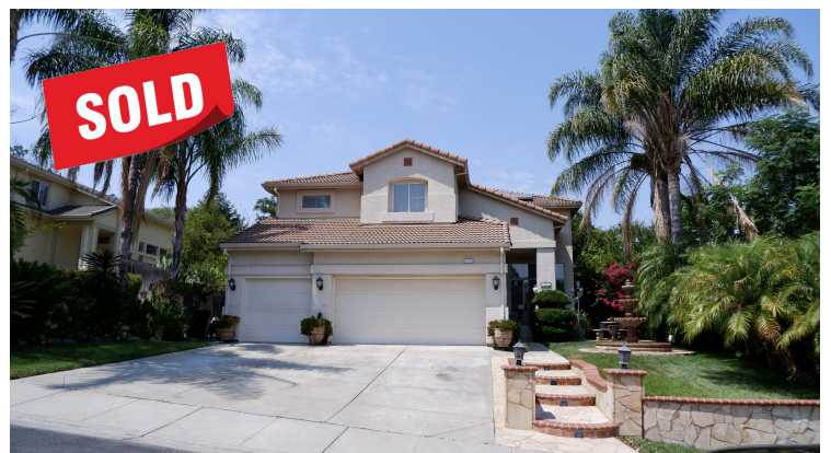
MARITA DR, ANTIOCH