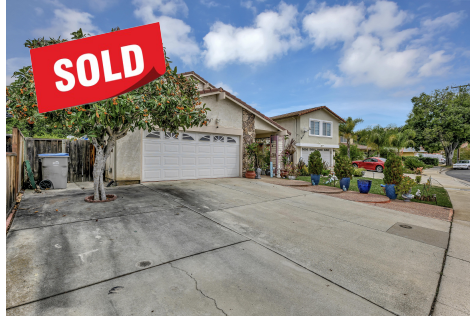
WOODSIDE LN, SAN JOSE