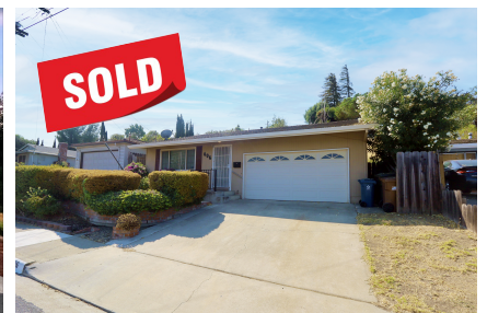
SHADDICK DR, ANTIOCH