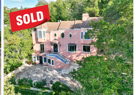
OAKWOOD RD, ORINDA