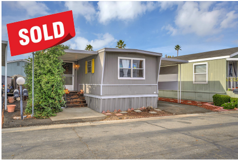
ALGIERS CIRCLE, PACHECO