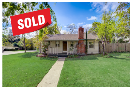
MCKISSICK ST, PLEASANT HILL