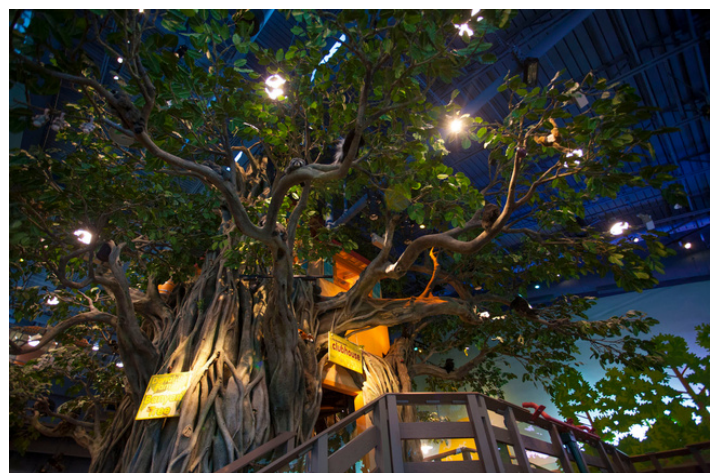
Above The Banyan Tree from Golisoano Children's Museum of Naples (CMON)