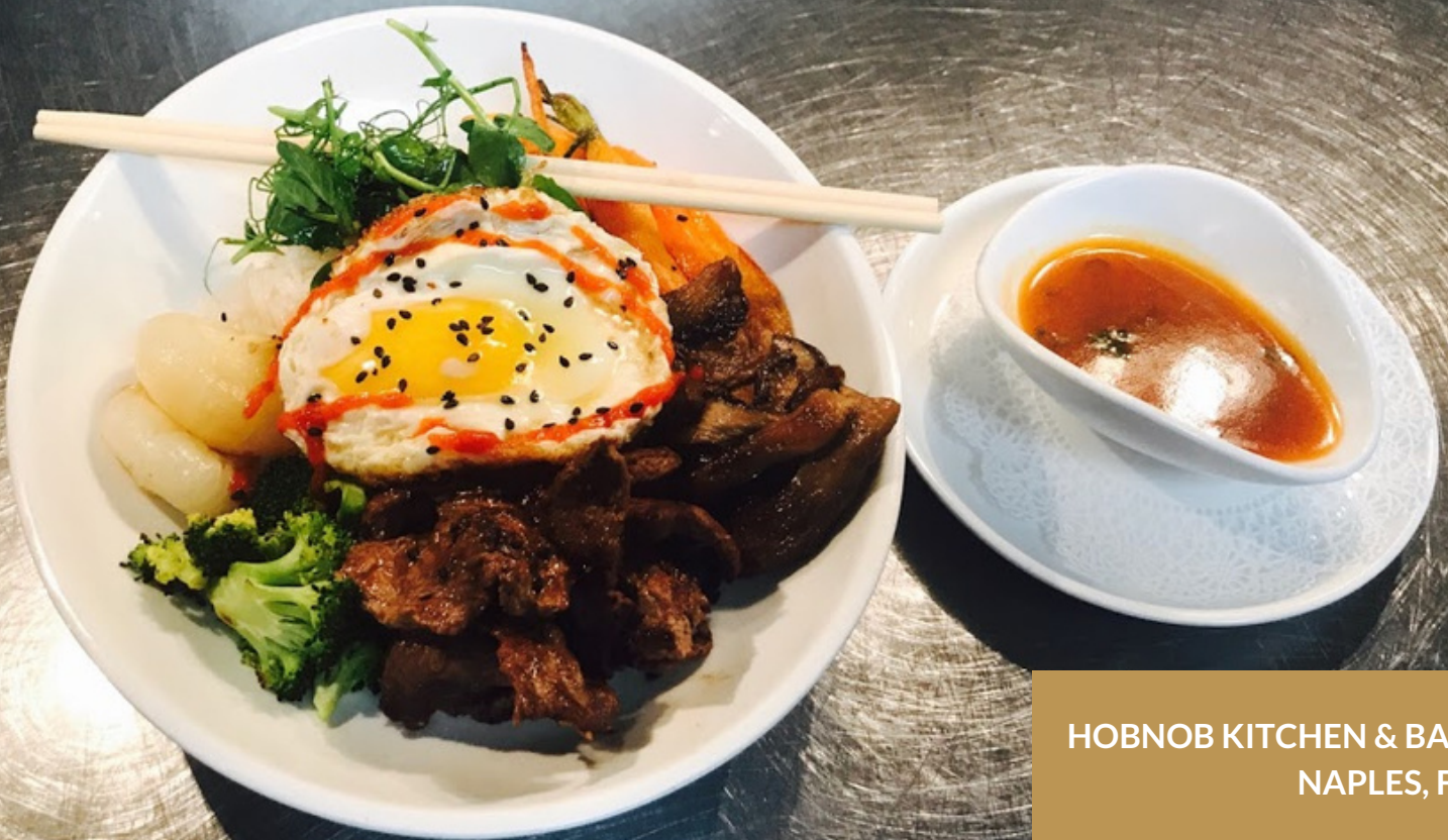
HOBNOB KITCHEN & BAR NAPLES, FL