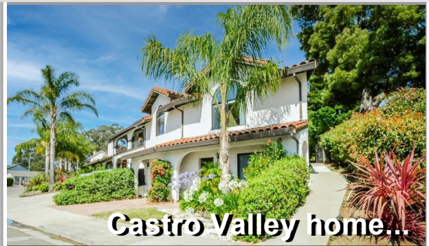
Castro Valley home...