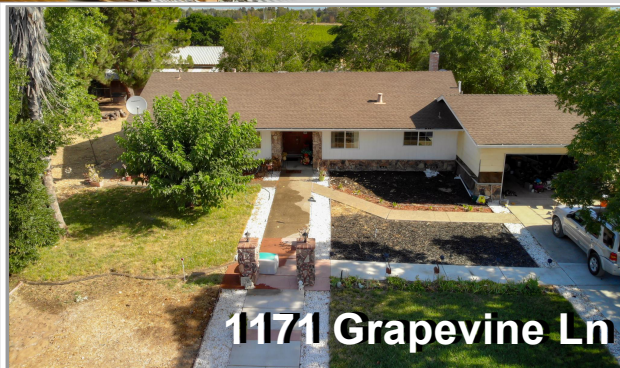
1171 Grapevine Ln