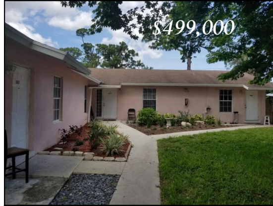
West Palm Beach, Four Units, 3/1, 3/2, 2/1, 2/1