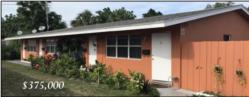
West Palm Beach, Four Units, All four are One Bedrooms