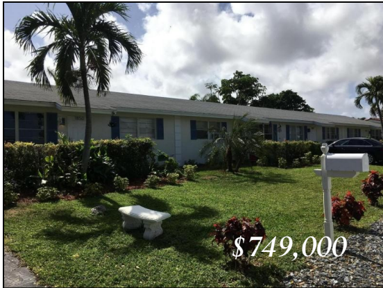
Juno Beach, Est. NOI $47,800 Quadplex, Four 2/1 units