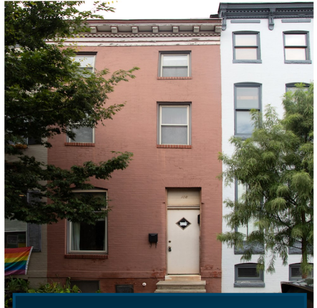
Small Investment Big Return! Baltimore, MD—4 bedrooms 2 bath