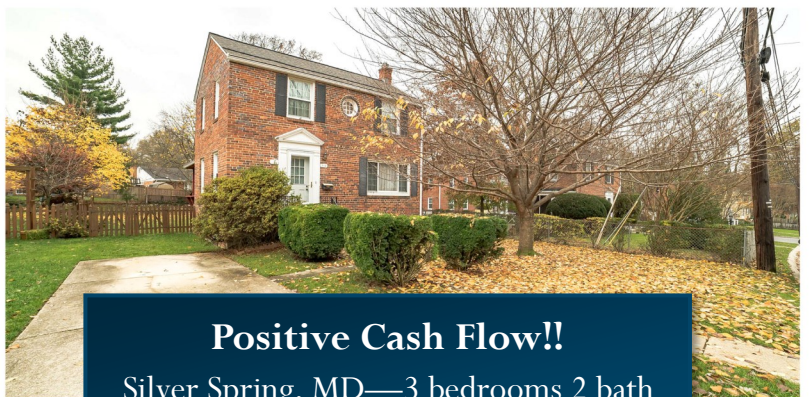
Positive Cash Flow!! Silver Spring, MD—3 bedrooms 2 bath

SAVETHOUSANDS When you Buy Your Next Property! Call 410-793-1616