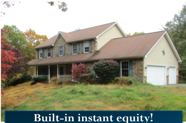
Built-in instant equity! North East, MD—4 bedrooms 3 bath