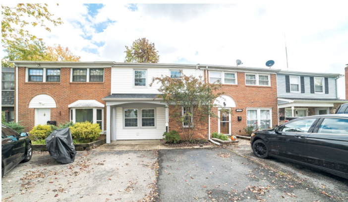
Waterfront—Great rental location! Joppa, MD—3 bedrooms 1.5 bath

Free list with pictures of available properties in your specific price range and area