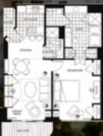
One Bedroom Suite