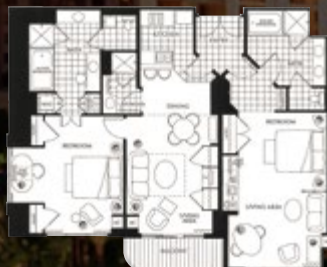
Two Bedroom Suite