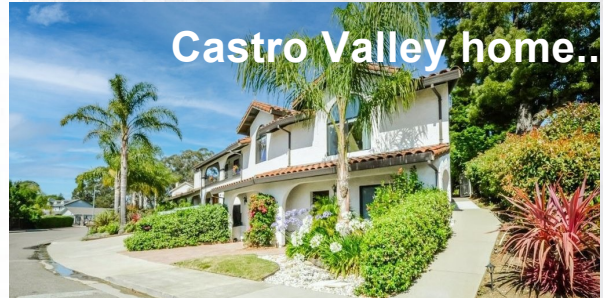
Castro Valley home..