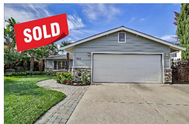
CALIFORNIA ST, RODEO