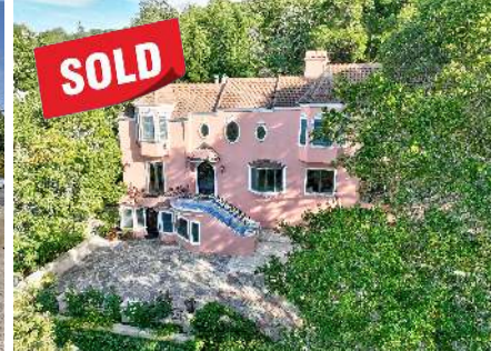
OAKWOOD RD, ORINDA