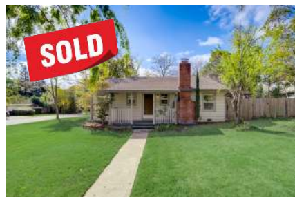
MCKISSICK ST, PLEASANT HILL