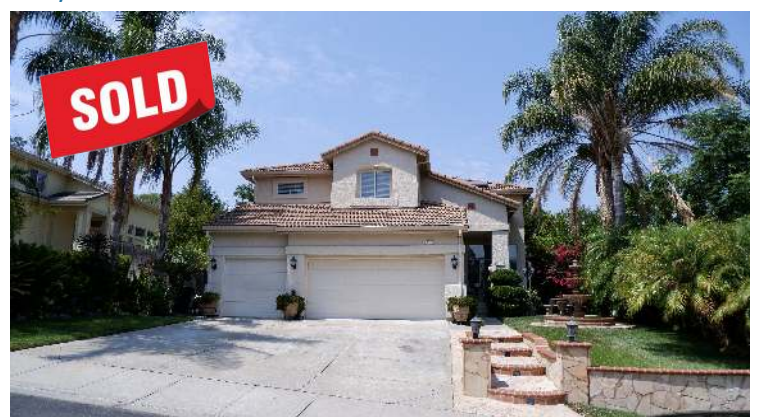
MARITA DR, ANTIOCH