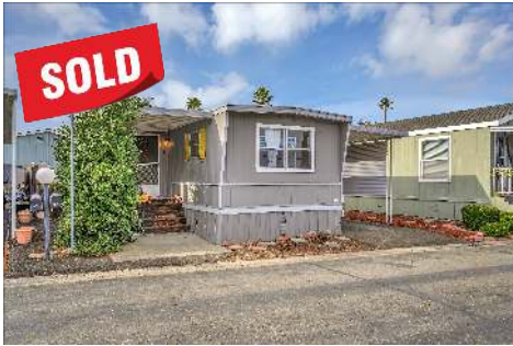
ALGIERS CIRCLE, PACHECO