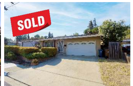
SHADDICK DR, ANTIOCH