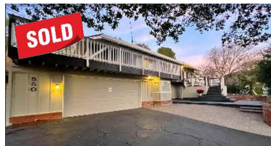
GOLF CLUB RD, PLEASANT HILL