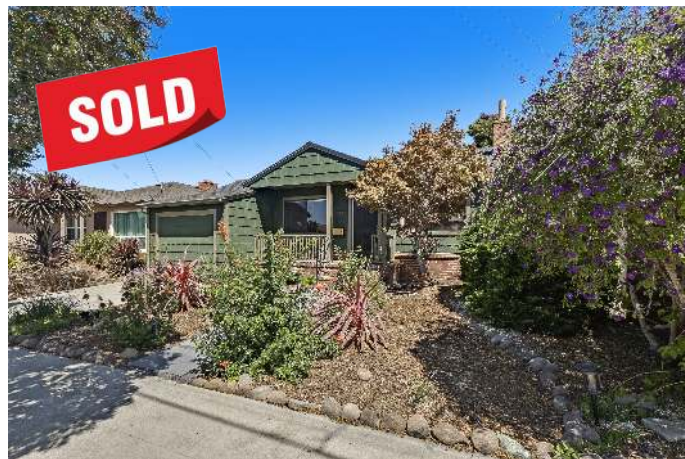
CLINTON AVE, RICHMOND