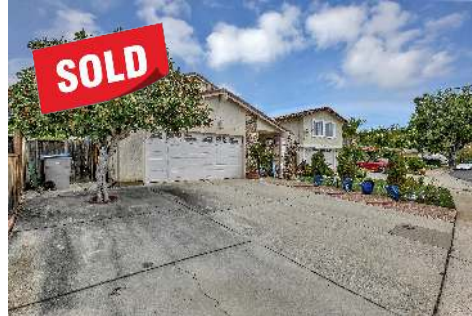
WOODSIDE LN, SAN JOSE