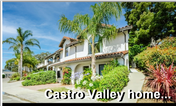
Castro Valley home...