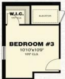
AVAILABLE BEDROOM #3