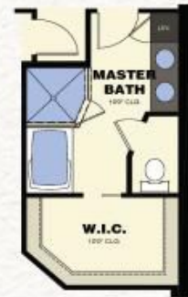
AVAILABLE ALTERNATE MASTER BATH WITH TUB