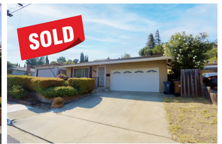
SHADDICK DR, ANTIOCH