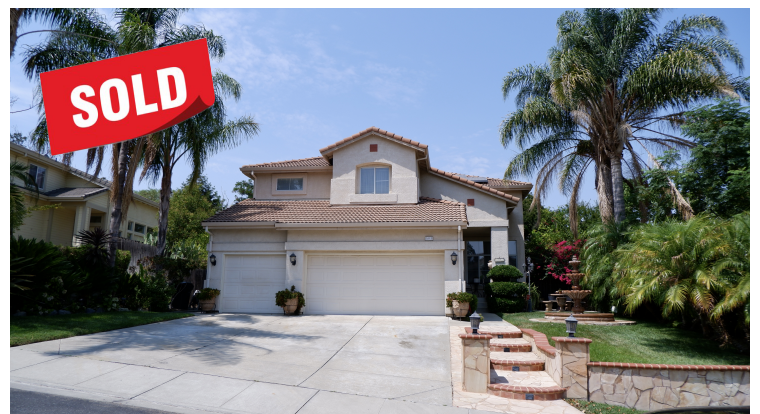
MARITA DR, ANTIOCH