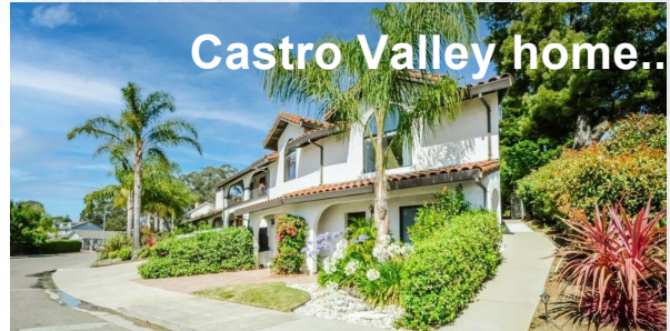
Castro Valley home..