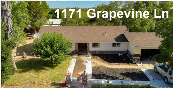
1171 Grapevine Ln