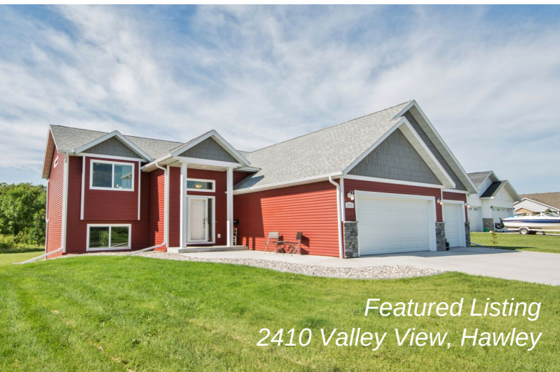
Featured Listing 2410 Valley View, Hawley

Your reviews are the greatest compliment we can receive!