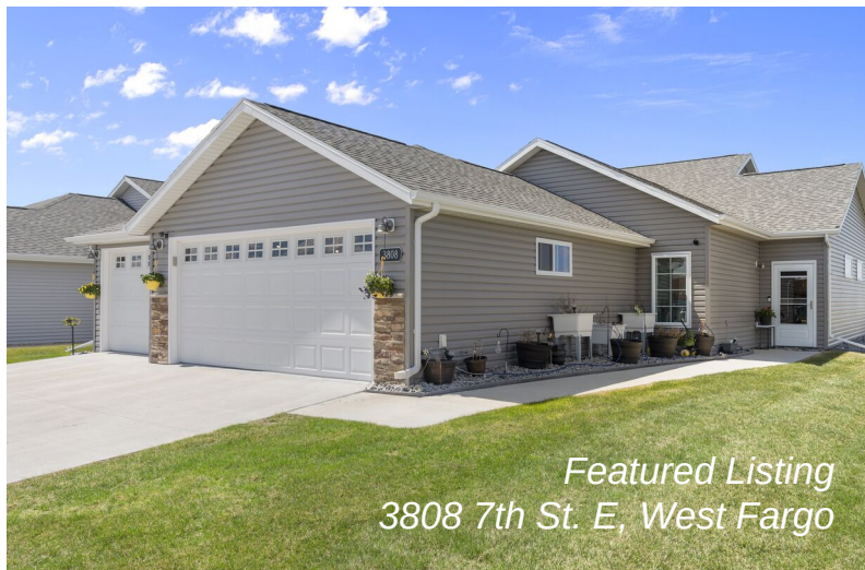
Featured Listing 3808 7th St. E, West Fargo