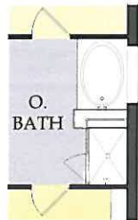
Opt. Owner's Bath #1