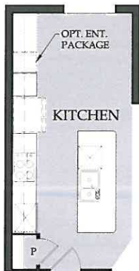
Opt. Kitchen Upgrade