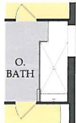
Opt. Owner's Bath #2