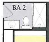
Opt. Shower ILO Tub @ Bath 2